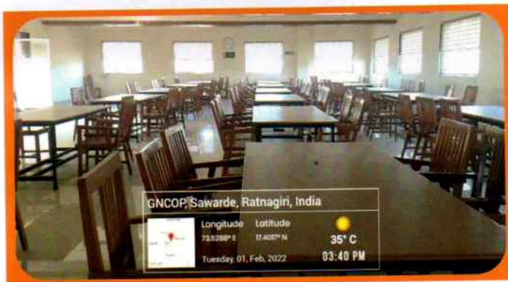
Natural sunlight in the Room