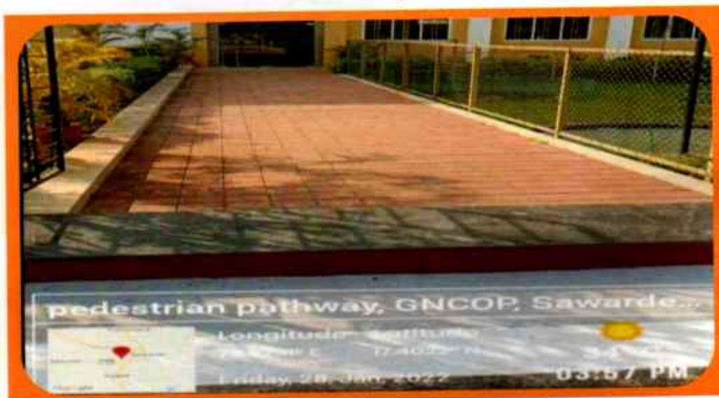
Pedestrian Friendly Pathway - 3