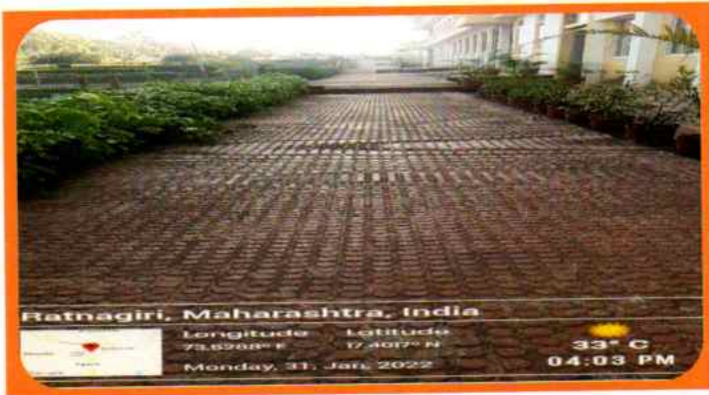
Pedestrian Friendly Pathway - 1