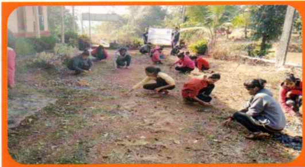
Cleaning the area