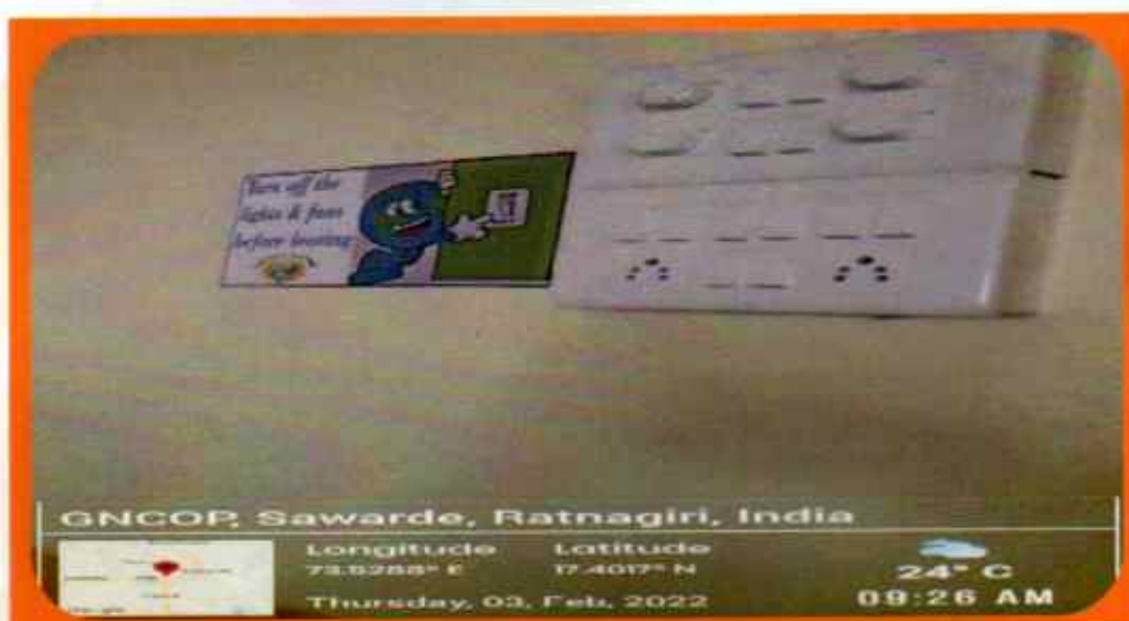
Energy saving poster