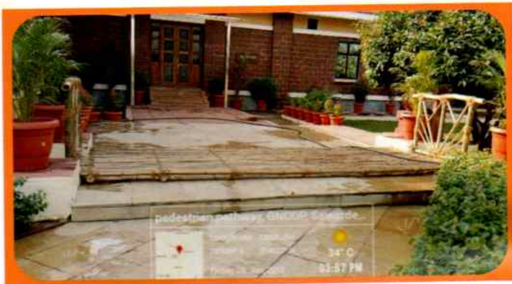
Pedestrian Friendly Pathway - 2