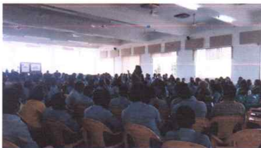
Think Management and Personality Development workshop: 7 th and 8 th October, 2017